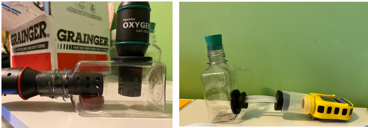
Figure 1. Apparatus set-up for detection of CO 2 , O 2 , and NH 3 for Beef Samples

The sensor set-up was configured as shown in Figure 1. For each set up, it was ensured the samples did not touch any of the sensors.