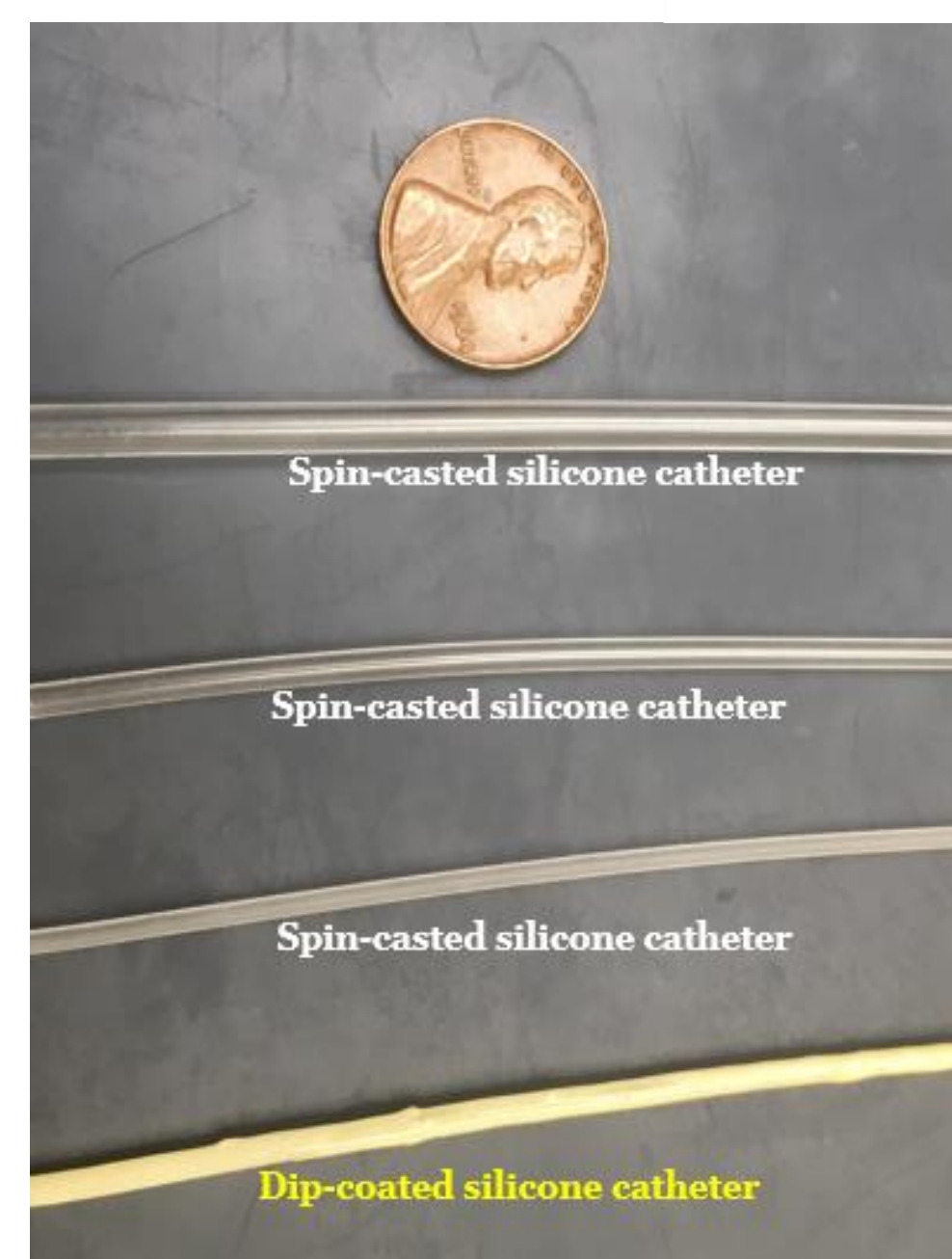
Figure 4: Comparison between spin-casted catheter versus dip-coated catheter

Catheters fabricated measured 4.9 \pm 0.7 cm long with 0.11 \pm 0.01 cm outer diameter and 0.07 \pm 0.01 cm inner diameter. The wall thickness measured 0.02 \pm 0.003 cm. The composition of NO releasing catheters all had 3.4% of DMHD-N 2 O 2 with either 0.1 g or 0.05 g or 0.01 g of PLGA. A control catheter( figure 3A ) and nitric oxide releasing catheter( figure 3B ) are shown in Figure 3 . Three samples were analyzed for each catheter group containing the above PLGA additive. As shown in Figure 3(C) , the level of NO flux was a function of PLGA amount and time. Catheters with higher PLGA content released higher NO levels within the measurement timeframe.