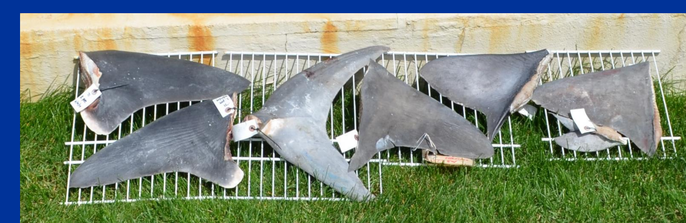
Figure Three: Fins during sun drying process

Back at the lab, fins were frozen to keep them preserved. Samples were documented by photography of the dorsal and ventral sides and measurements were taken. Samples were refrozen until ready to be salted. The fins were then packed with salt and left over night. The following day, the fins were either put outside to sundry or placed back into the freezer, awaiting to be sundried. Samples were sundried for two to four weeks, depending on size. Lastly, after being sundried, the fins were measured again.