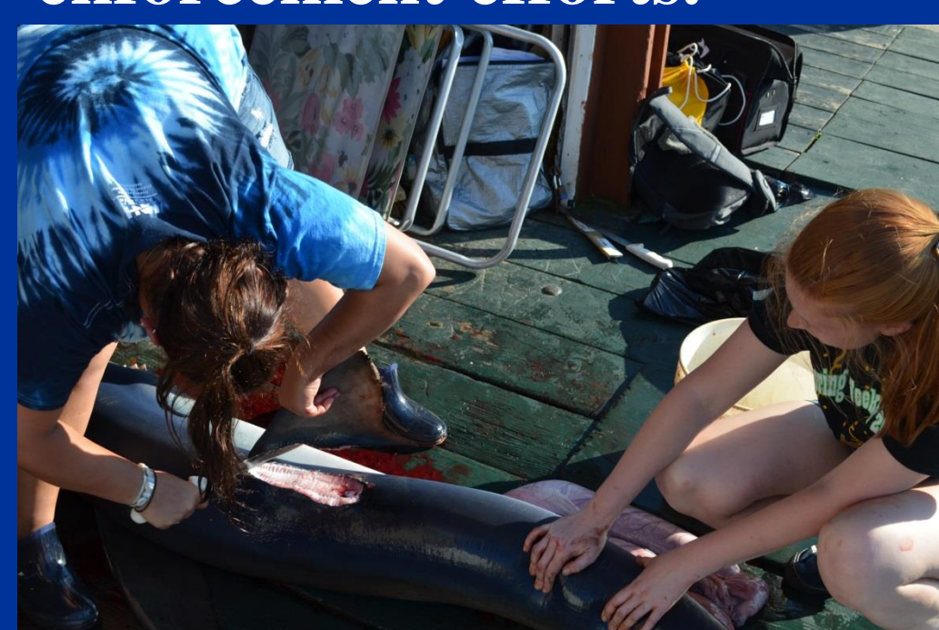
Figure One: SURF students sampling blue shark at Montauk Marine Basin Tournament

This is why the research being conducted is important to the enforcement of shark laws. This project is examining the morphological characteristics in order to differentiate shark fins from those of any other elasmobranch. The research will also look into the collagen fibers located within the fins to build data on the differences between both the fin types and the species. If successful, an easy and inexpensive way to differentiate between shark and other elasmobranch species will be created for law enforcement efforts.