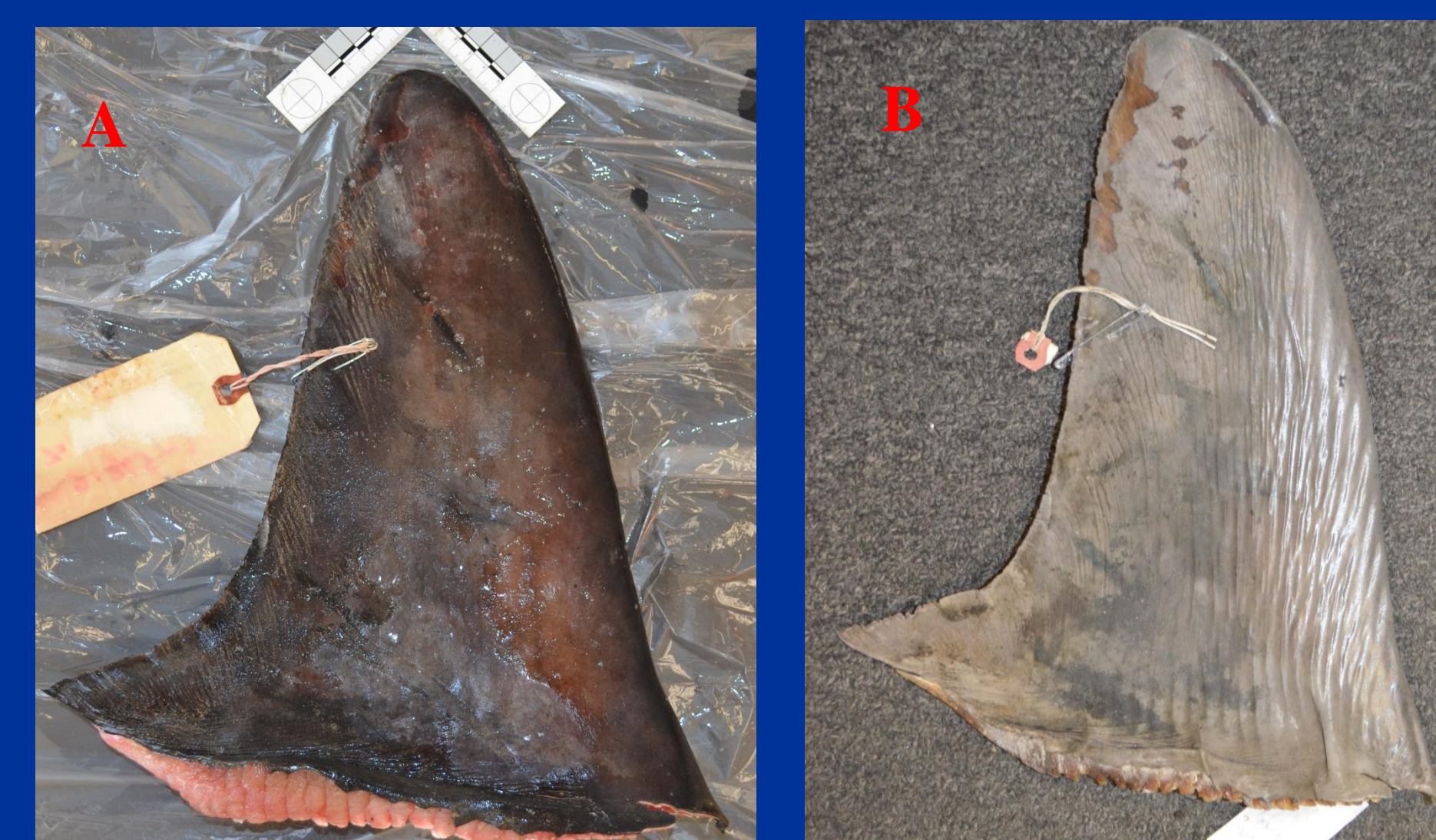
Figure Four: Photo A, is the dorsal fin from a Common Thresher shark, in fresh form. In photo B, the same fin is shown, but in the dried form. Note the ridges on the dried form which are the collagen fibers.