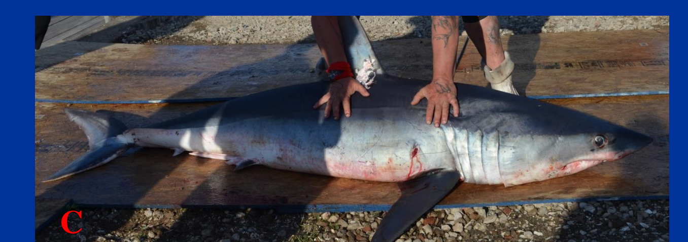
Figure Five: Figures A, B, and C correlate to an images of collected sharks during summer 2014. Photo A shows a blue shark, photo B shows a Common Thresher shark, and photo C shows a Short-Fin Mako Shark. All images are of the sharks shortly after being delivered to the dock for weighing.