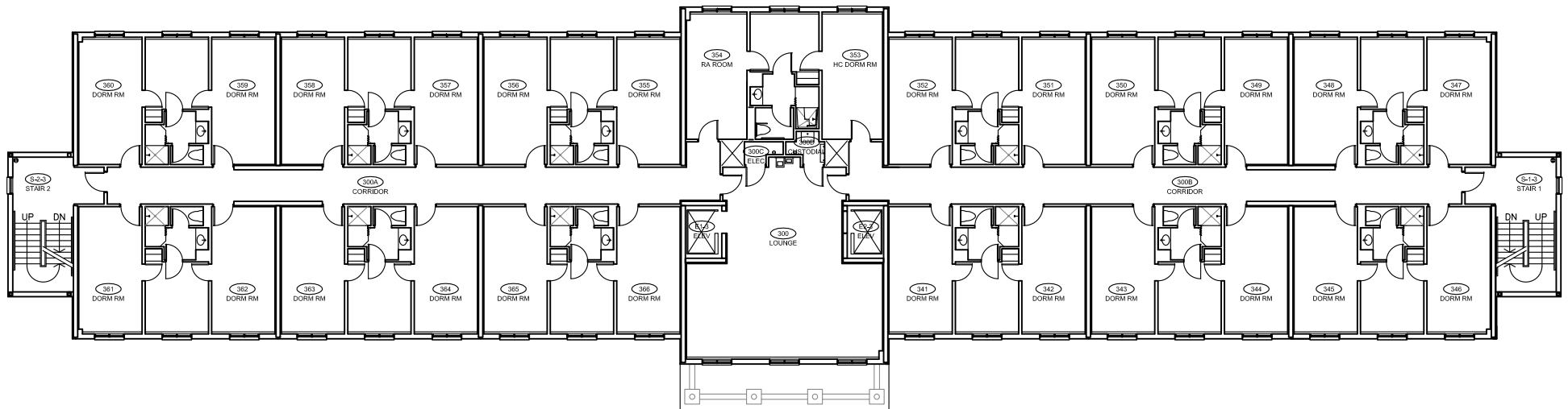
1 3rd Floor Plan NOT TO SCALE