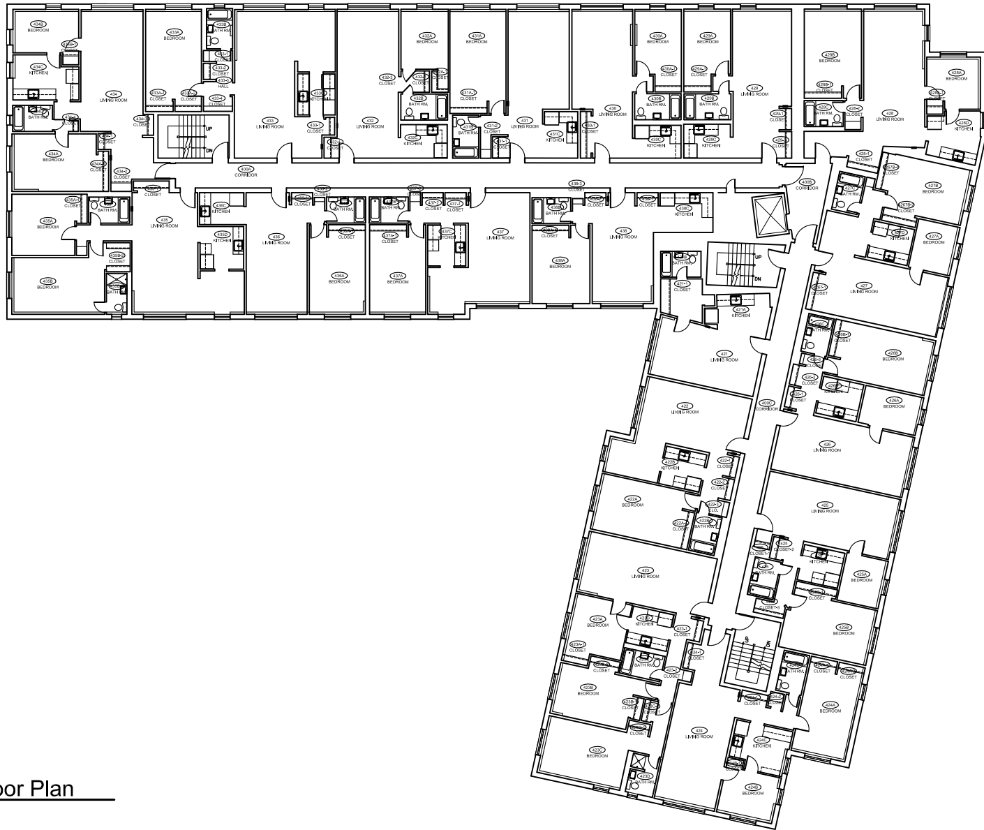
1 Fourth Floor Plan NOT TO SCALE